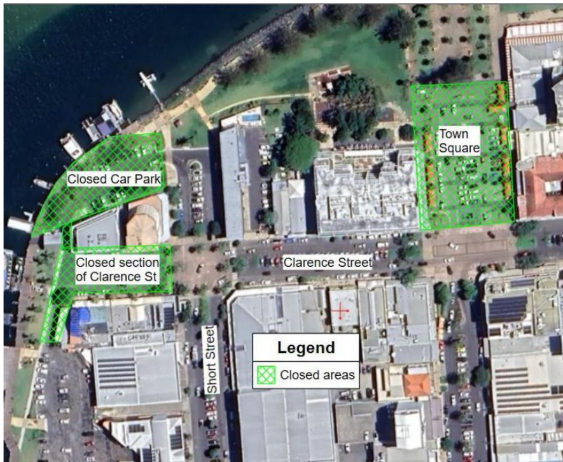
Image 1. Location of works.

Weather may affect the event but will not affect the operation of the Traffic Management Plan. Council as event sponsor will have the final say with respect to the completion of the event in the occurrence of inclement weather.