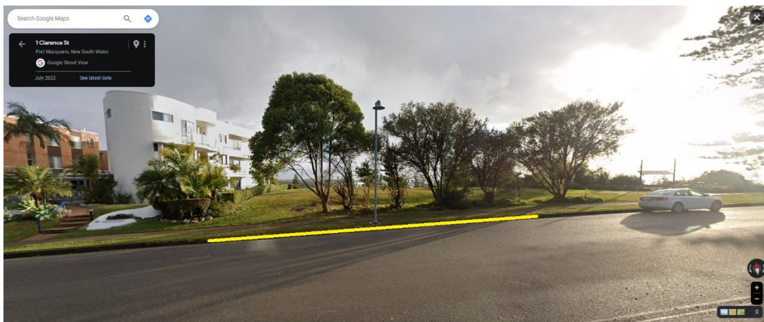
Image 2 - Location of 4P parking restrictions

In addition, the location of the 4P EV Charging parking zone is shown approximately by the yellow line on the Google Streetview image below: